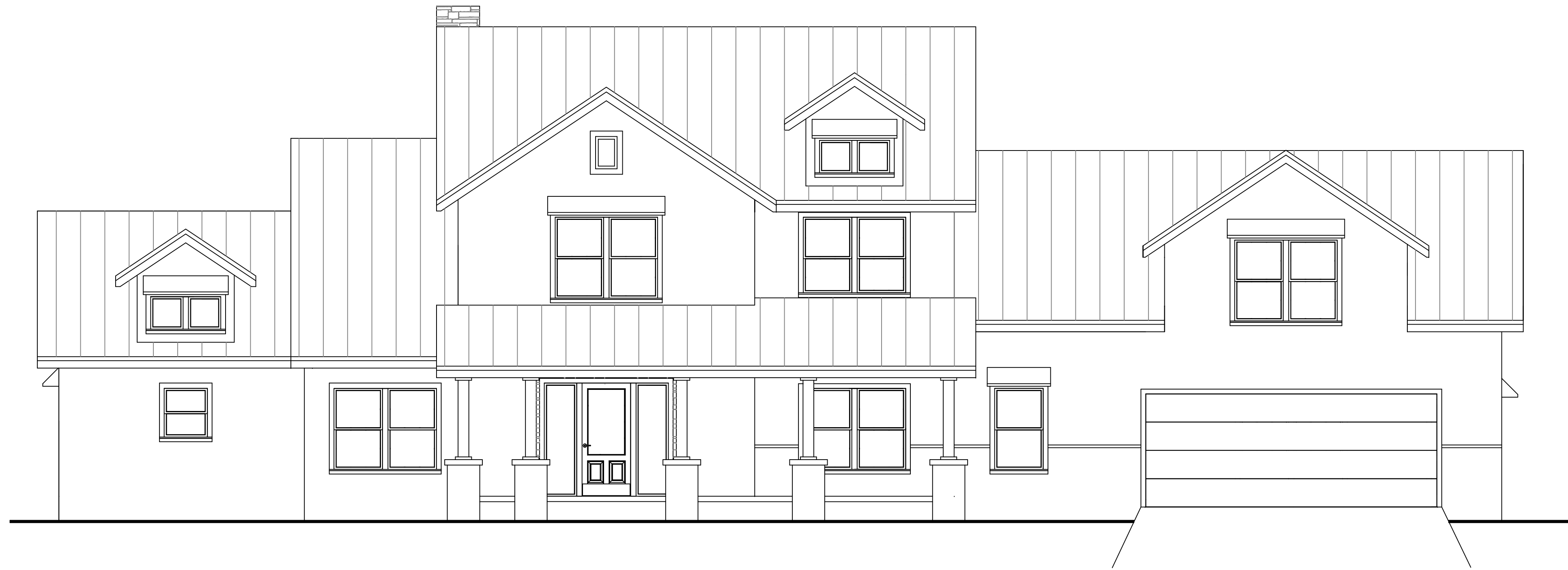
FRONT ELEVATION NOT TO SCALE

NOTE: THIS PLAN WAS CREATED FOR A CONCRETE SLAB, BUT CAN BE ALTERED TO ACCOMMODATE A BASEMENT OR FOUNDATION