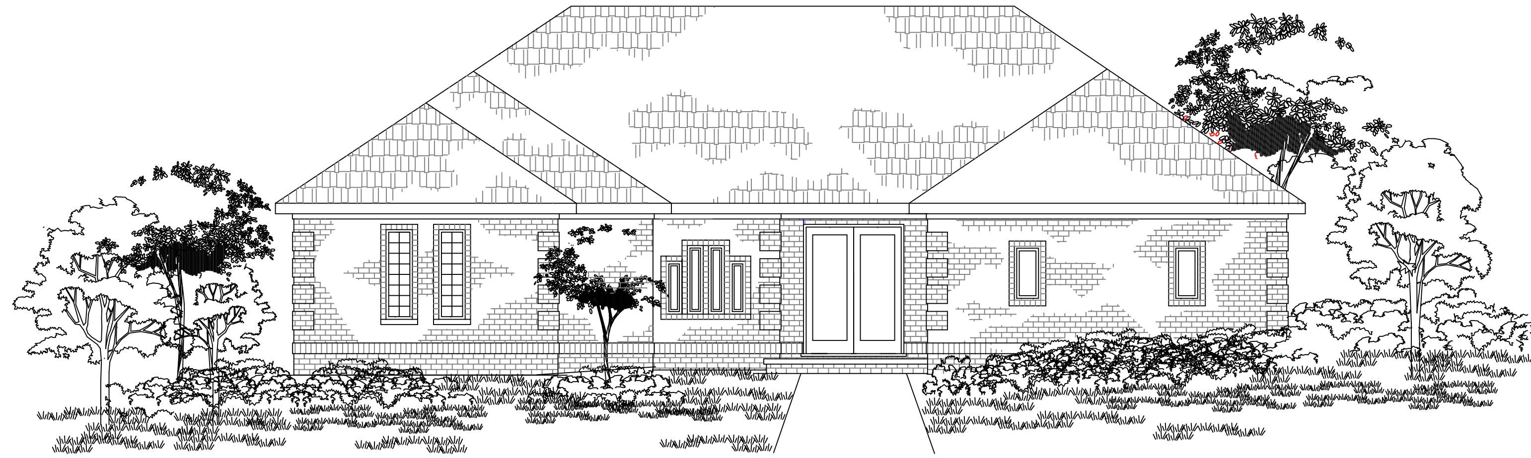
FRONT ELEVATION NOT TO SCALE

NOTE: THIS PLAN WAS CREATED FOR A BASEMENT, BUT CAN BE ALTERED TO ACCOMODATE A SLAB OR FOUNDATION