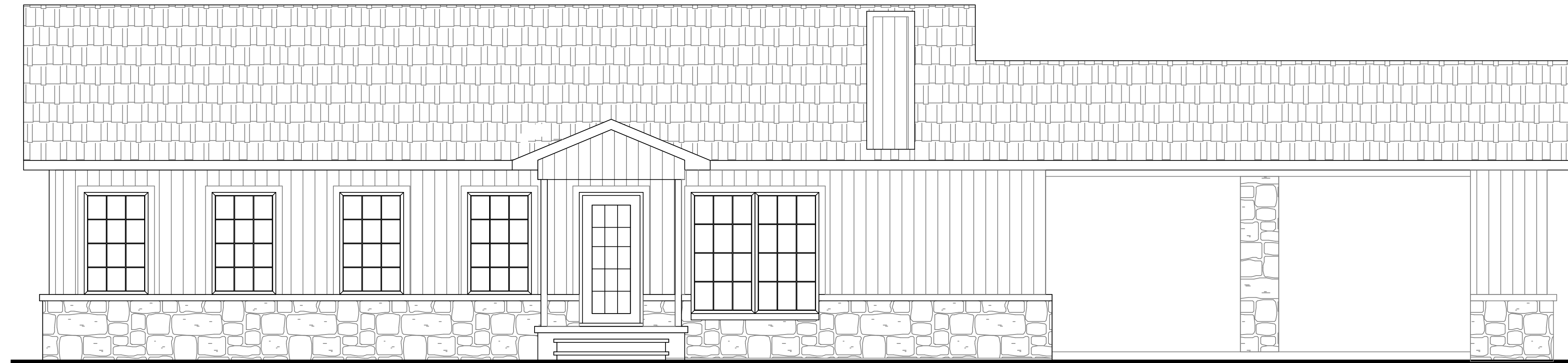
FRONT ELEVATION NOT TO SCALE

NOTE: THIS PLAN WAS CREATED FOR A SLAB OR FOUNDATION, BUT CAN BE ALTERED TO ACCOMODATE A BASEMENT