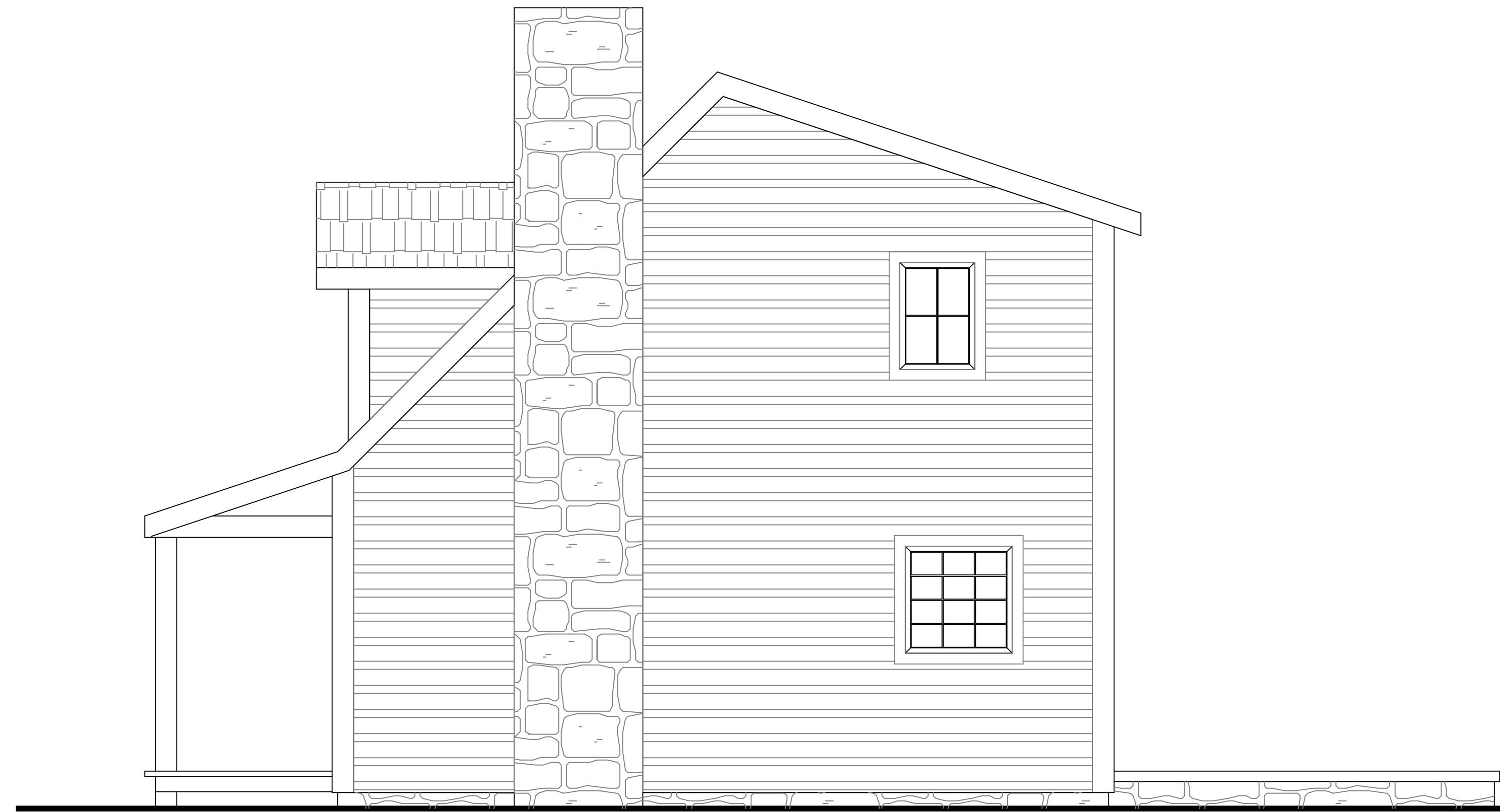
RIGHT ELEVATION NOT TO SCALE