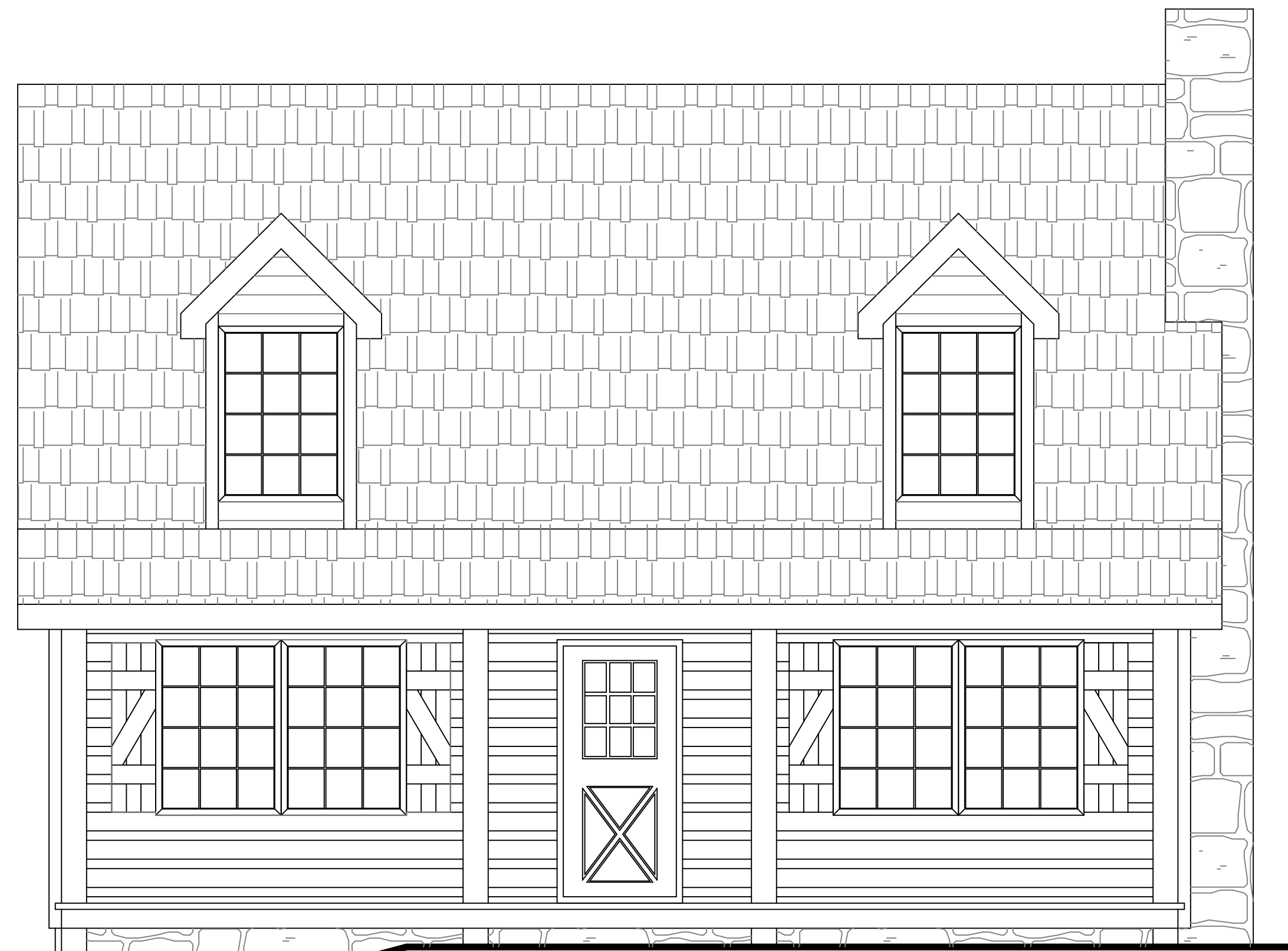
FRONT ELEVATION NOT TO SCALE