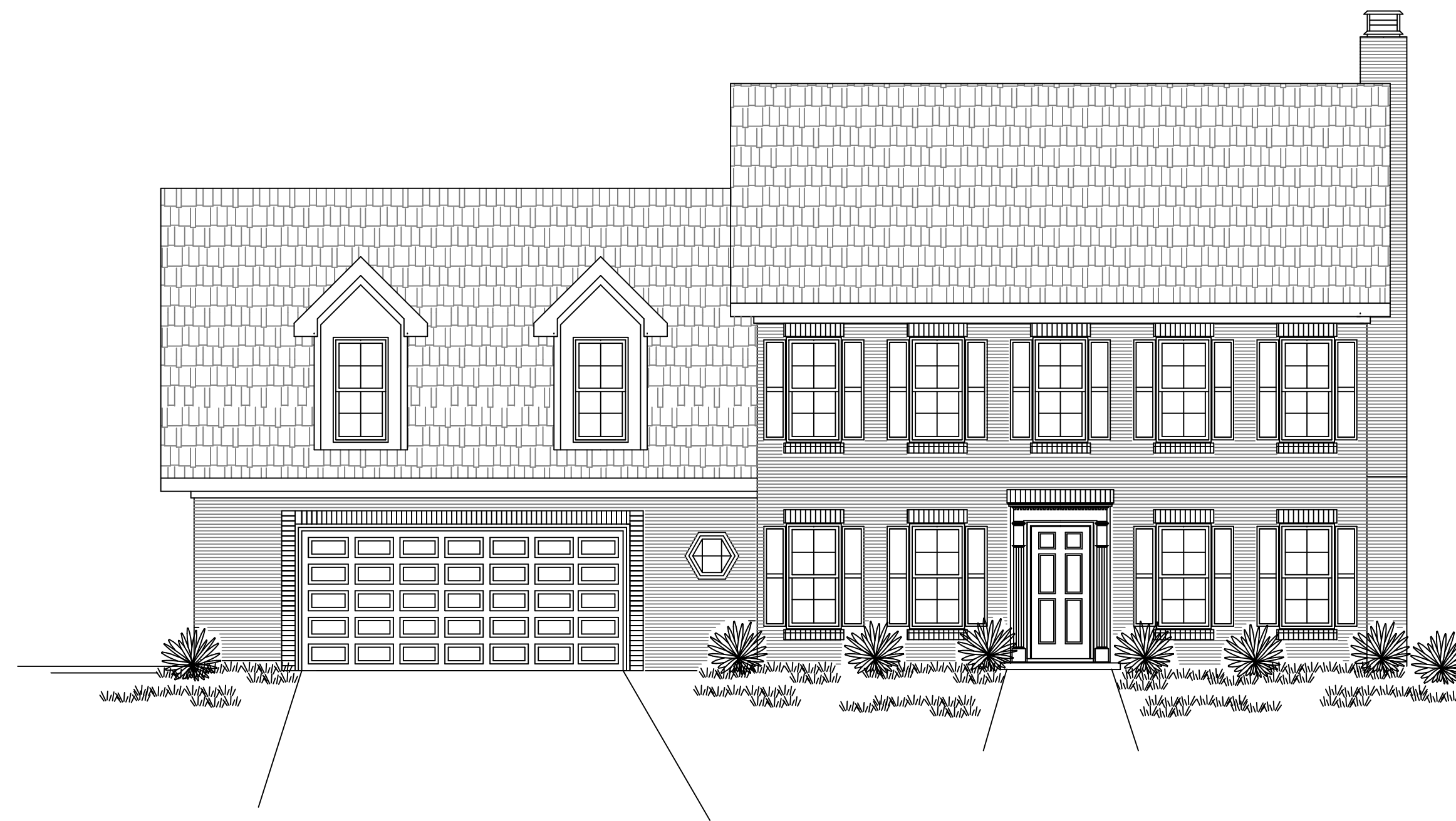
FRONT ELEVATION NOT TO SCALE

NOTE: THIS PLAN WAS CREATED FOR A SLAB OR FOUNDATION, BUT CAN BE ALTERED TO ACCOMODATE A BASEMENT