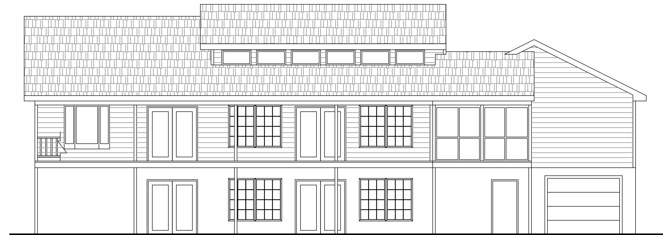
REAR ELEVATION NOT TO SCALE